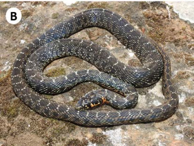
Figure 1. Recurrent colour patterns of Hemorrhois hippocrepis from the population of Pantelleria (Italy) - A. Typical juvenile, and B. Dark morph adult

10 supralabials, 8 infralabials, 1 preocular, 2 postoculars, 3 suboculars, 1 loreal, 2 nasals, 3 anterior temporals and 3 posterior temporals. Based on its size and according to